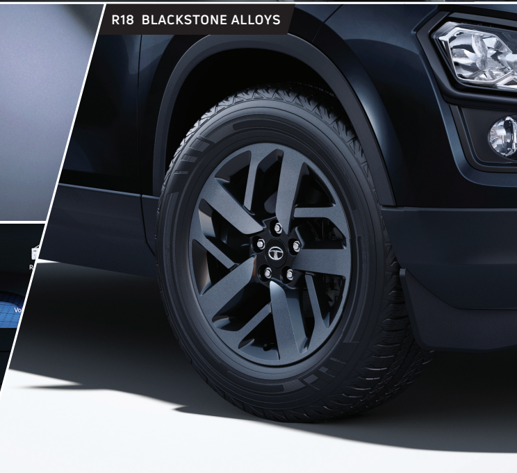
R18 BLACKSTONE ALLOYS