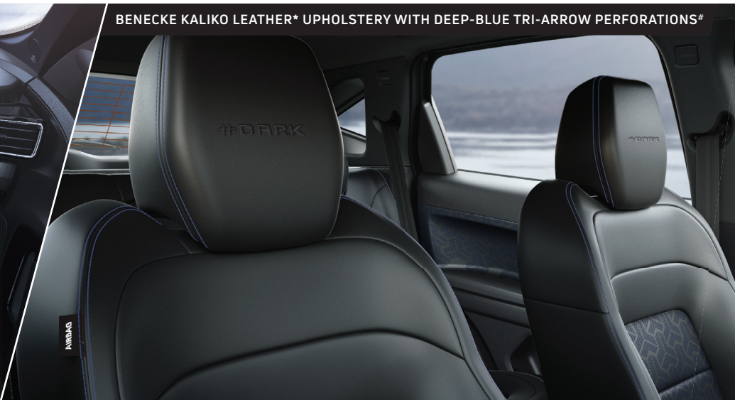
BENECKE KALIKO LEATHER* UPHOLSTERY WITH DEEP-BLUE TRI-ARROW PERFORATIONS#