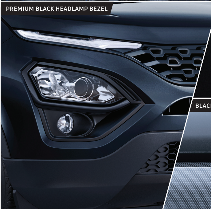
PREMIUM BLACK HEADLAMP BEZEL