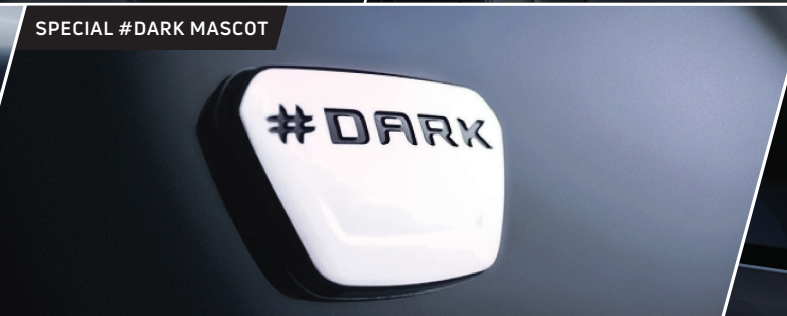
SPECIAL #DARK MASCOT