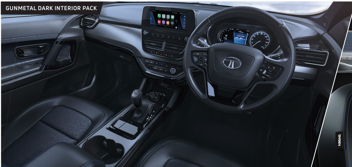
GUNMETAL DARK INTERIOR PACK