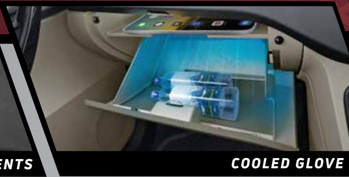
COOLED GLOVE BOX