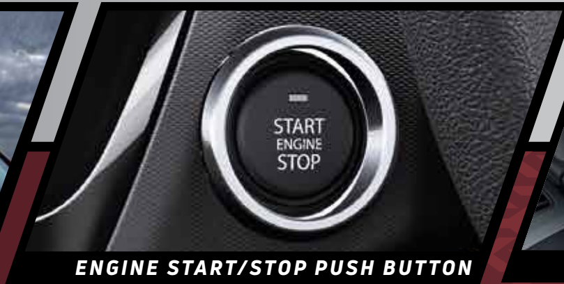
ENGINE START/STOP PUSH BUTTON