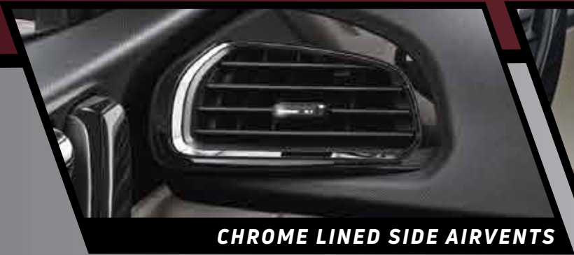
CHROME LINED SIDE AIRVENTS