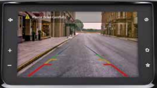
REAR PARKING ASSIST WITH CAMERA