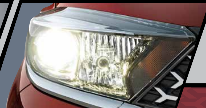
AUTOMATIC PROJECTOR HEADLAMPS