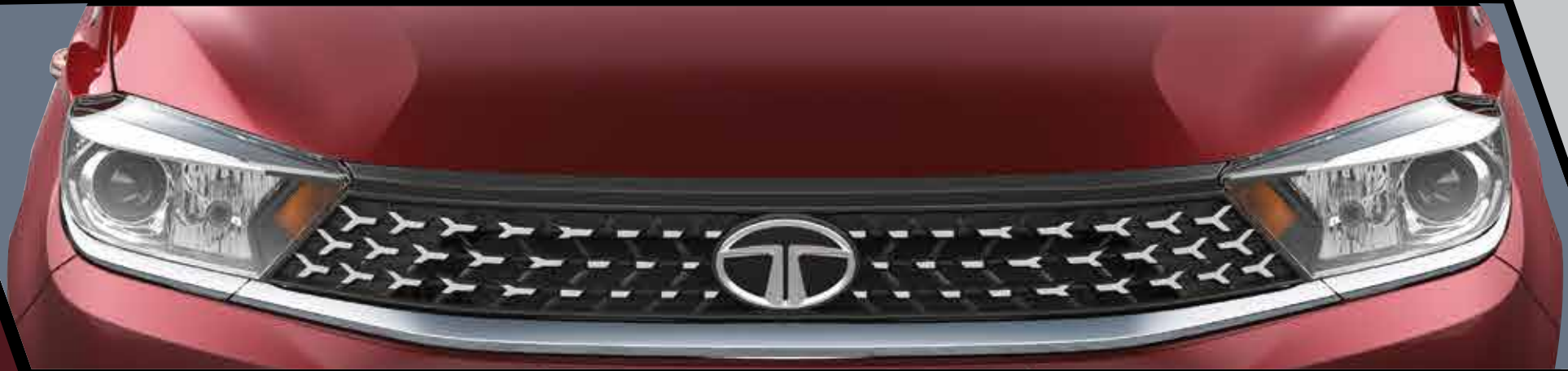
STYLISH CHROMED TRI-ARROW FRONT GRILLE