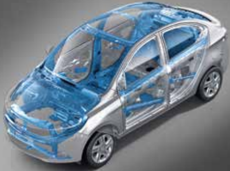
ENERGY ABSORBING STRUCTURE