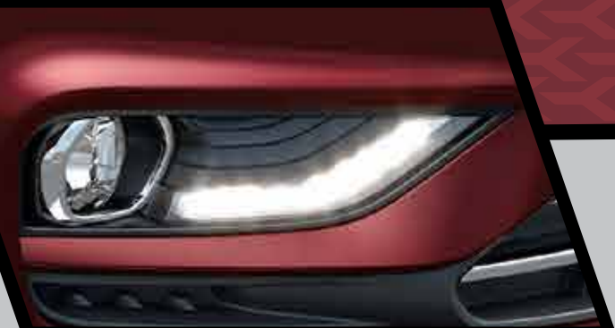
FRONT FOG LAMPS WITH CHROME RING SURROUNDS