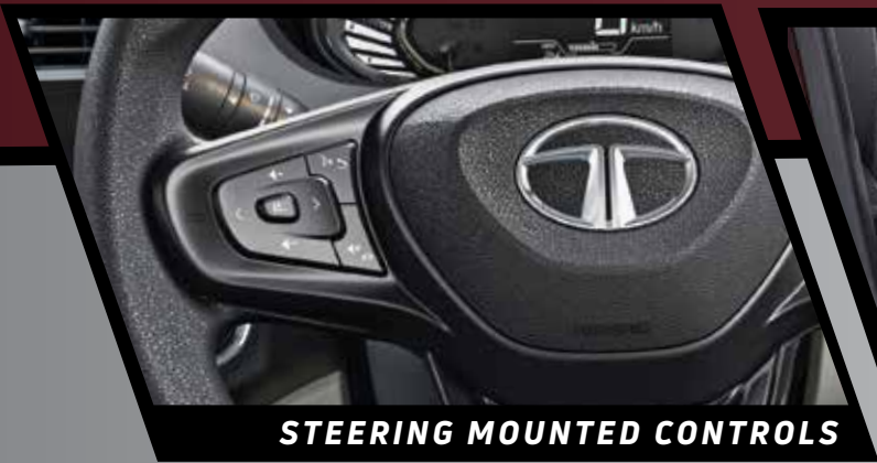
STEERING MOUNTED CONTROLS