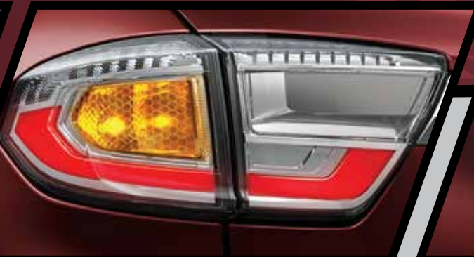
BOLD & BRIGHT LED TAIL LAMPS