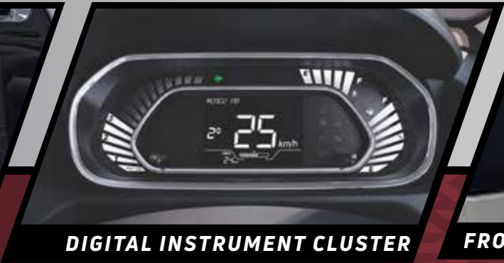
DIGITAL INSTRUMENT CLUSTER