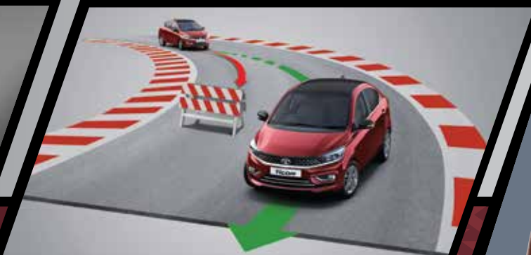
ABS WITH EBD AND CORNER STABILITY CONTROL