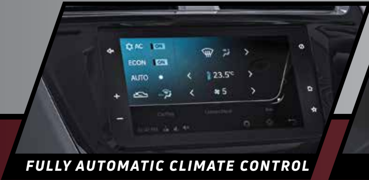
FULLY AUTOMATIC CLIMATE CONTROL