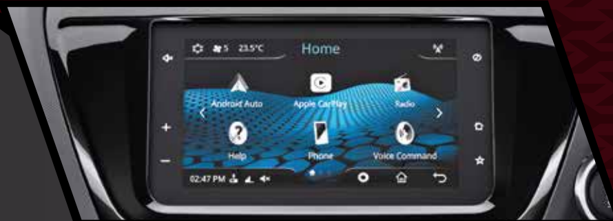
17.78 cm TOUCHSCREEN HARMAN™ INFOTAINMENT SYSTEM WITH ANDROID AUTO™ & APPLE CARPLAY™