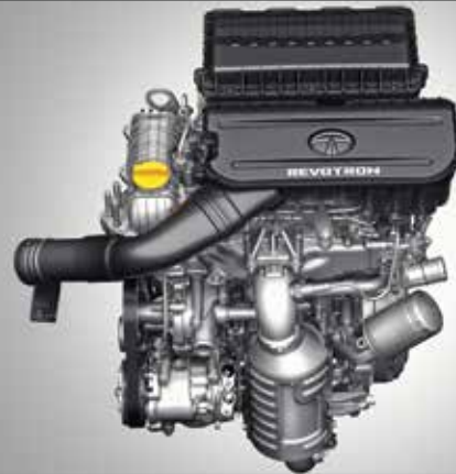
1.2L REVOTRON BS6 ENGINE