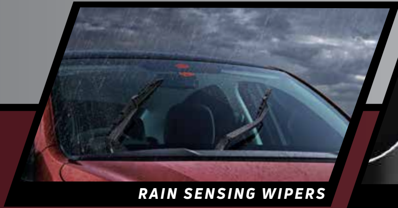
RAIN SENSING WIPERS