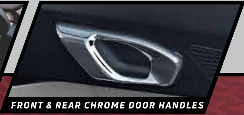
FRONT & REAR CHROME DOOR HANDLES