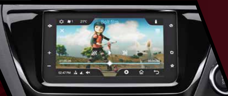
IMAGE & VIDEO PLAYBACK