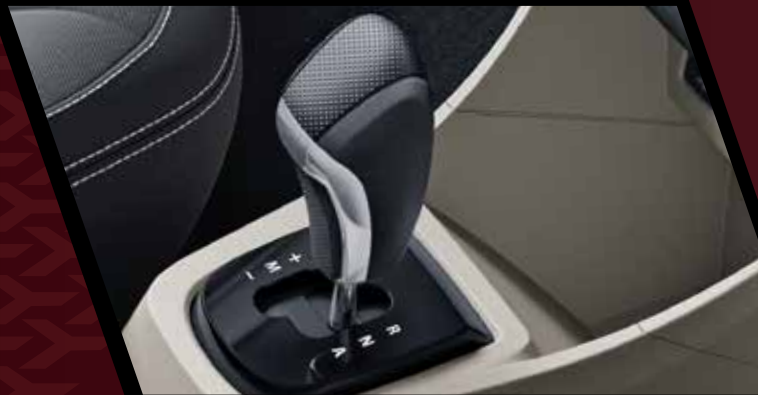
ADVANCE AMT TRANSMISSION