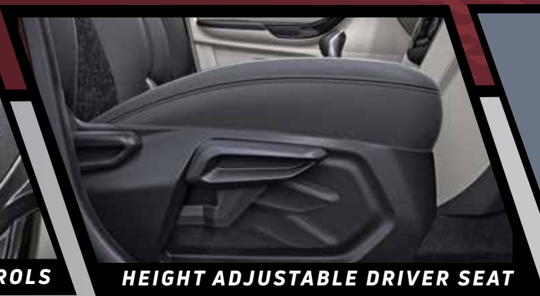
HEIGHT ADJUSTABLE DRIVER SEAT