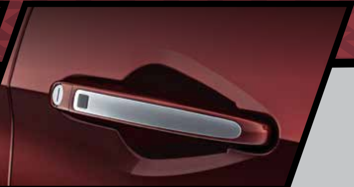
CHROME-LINED DOOR HANDLES