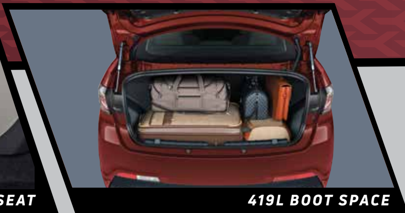
419L BOOT SPACE